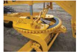
53" gear driven circle with "A" frame allows 360° blade rotation