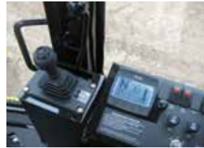
Full power shift transmission with torque converter