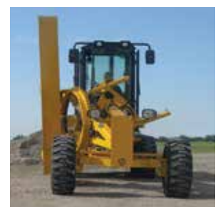
90° Bank slope saddle