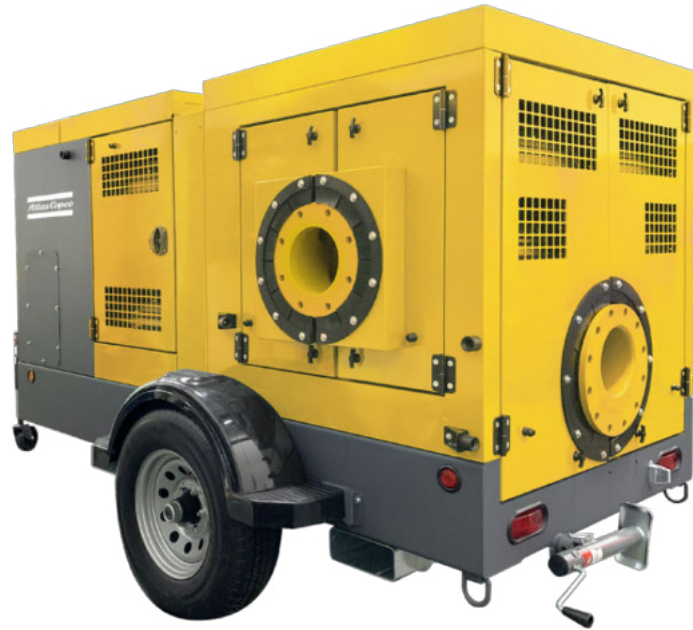
Indicative picture of the product

Diesel - Qmax 850 m 3 /h (3,740 USgpm) - Hmax 50 m (164 ft)